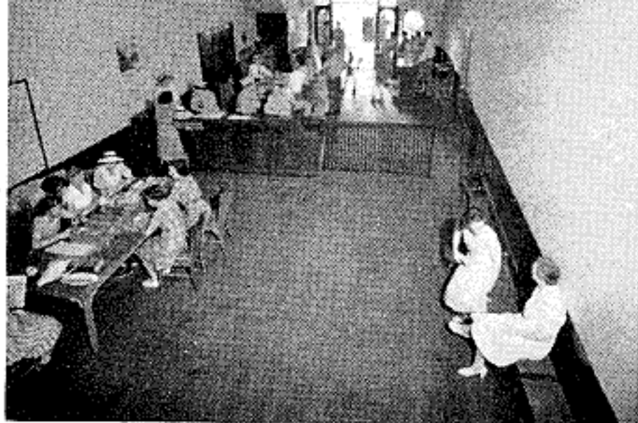
235 South Tryon Street