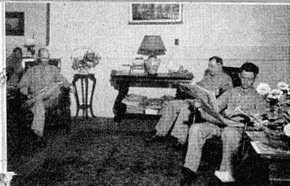
Traveler's Aid Soldier's Center