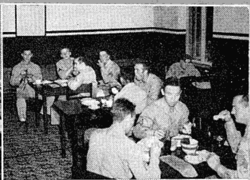
Salvation Army Soldier's Center