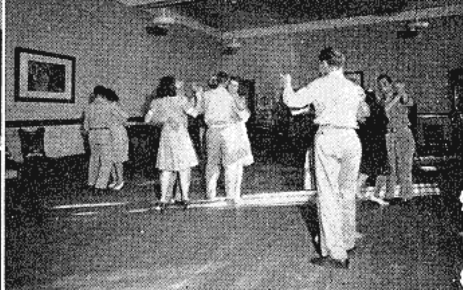
Catholic Men's Club