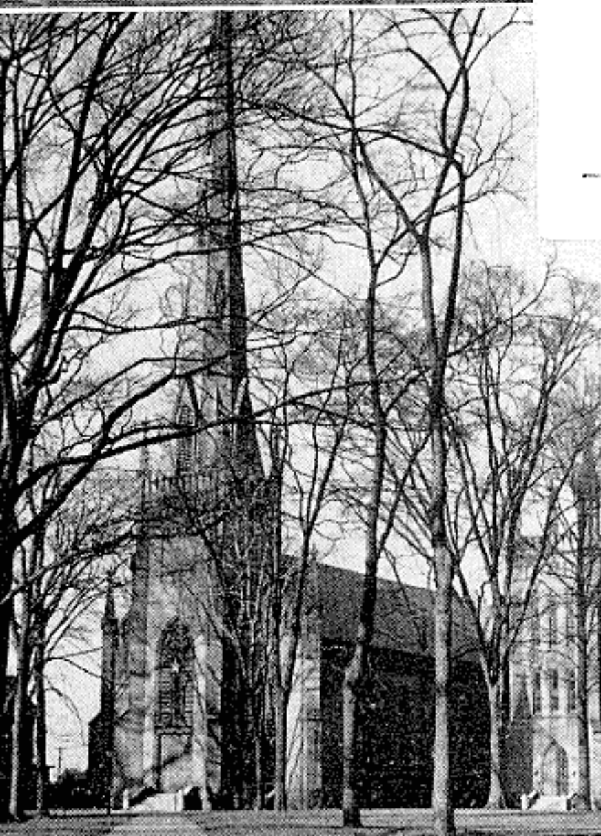
Below: First Methodist Church.