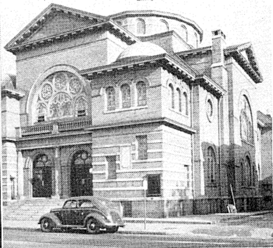
Above: First Baptist Church.