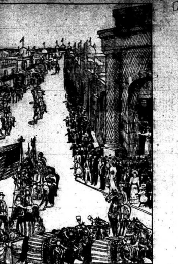
BLESS PARADE LEAVING THE MIDWAY.