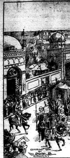
BLESS PARADE LEAVING THE MIDWAY.